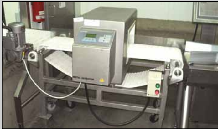
LOMA STS METAL DETECTOR

2006 AMFEC VI-B Stainless Steel Hydraulic Portable Elevator , 750-lb. capacity.