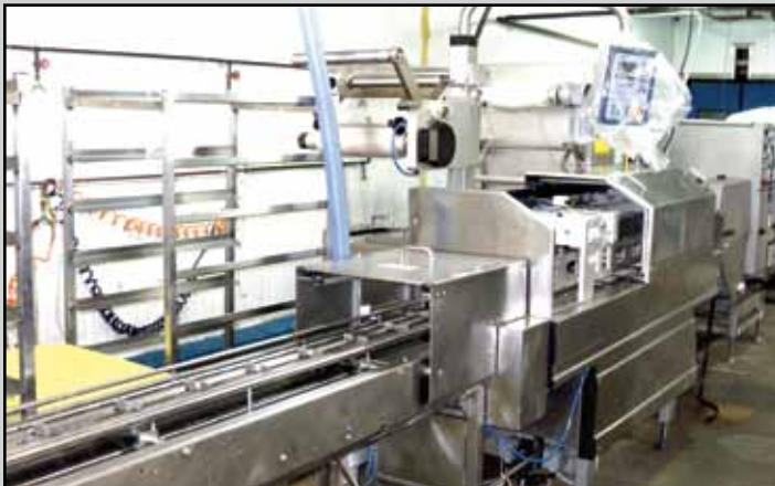
(1 OF 2) MULTI-VAC R-140 ROLL STOCK VACUUM TRAY FORMERS

(4) BIZERBA Mdl. GLM 1 Automatic Inline Belt Conveyor Checkweigher Systems, 15" x 60" rubber belt over stainless steel conveyors, digital labelers including top and bottom inkjet encoding heads, digital programmable PLC controls.