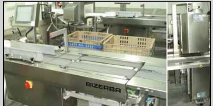
(1 OF 4) BIZERBA GLM-1 CHECKWEIGHER-LABELING SYSTEMS