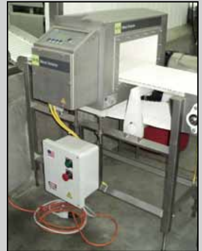
STS METAL DETECTOR WITH CONVEYOR

(4) BIZERBA GLP Label Printers, with stainless steel carts and programmable controls.