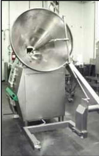
VEMAG ROBOT HP15C STAINLESS STEEL EXTRUDER-STUFFER WITH HYDRAULIC ELEVATOR LIFT

(2) SIPROMAC TN250 Roll Stock Vacuum Tray Former-Wrappers, 3-up die set x 12" wide configuration, with on-board 10 HP vacuum pumps, vacuum scrap cans.