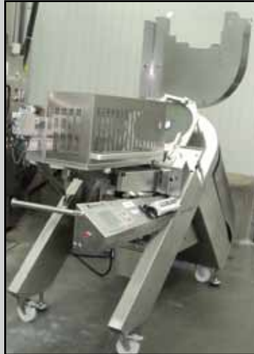
BIZERBA A-510 ROTARY SLICER