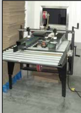
(1 OF 3) 2008 SAMUEL ADJUSTABLE WIDTH TOP-BOTTOM BOX TAPERS