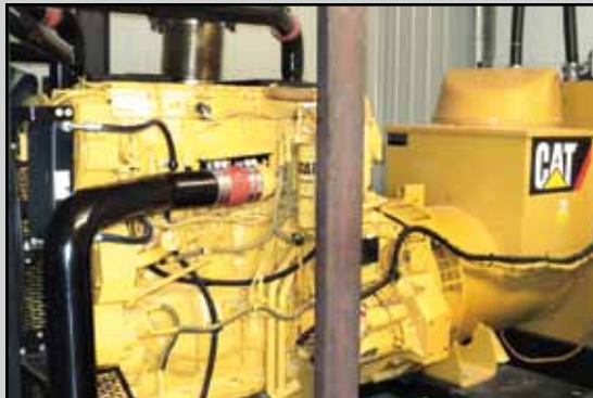
2008 CAT DIESEL LC-6 600 KW, 760 KVA SKID-MOUNTED DIESEL GENSET

(3) 12" x 84" INTRALOX, over stainless steel adjustable speed portable straight conveyors.