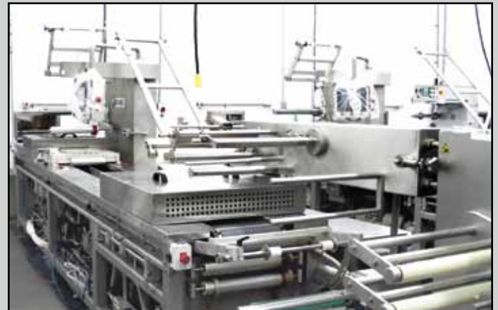
(1 OF 2) SIPROMAC TN250 ROLL STOCK VACUUM TRAY FORMER-WRAPPER