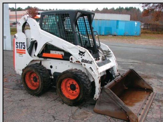
BOBCAT S-175 SKID STEER LOADER