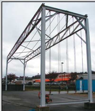
20' x 12' x 62' CUSTOM TENT DRYING SYSTEM