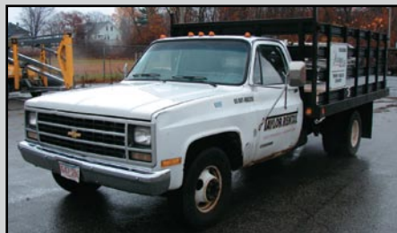
1989 CHEVROLET 12' STAKEBODY FLATBED TRUCK