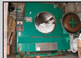
AMERICAN 450-LB. CAP. WASHING MACHINE