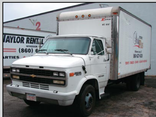
1995 CHEVROLET 16' BOX TRUCK