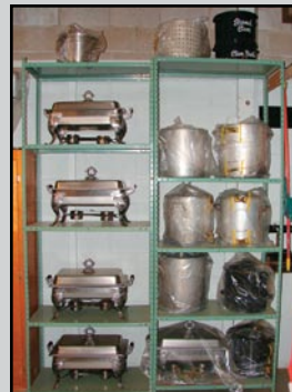
RESTAURANT & CATERING EQUIPMENT