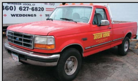
1997 FORD F-250 PICKUP